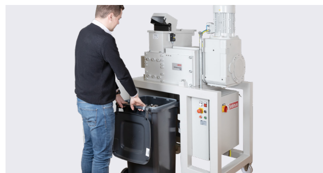
Standard 120 litres collection bin