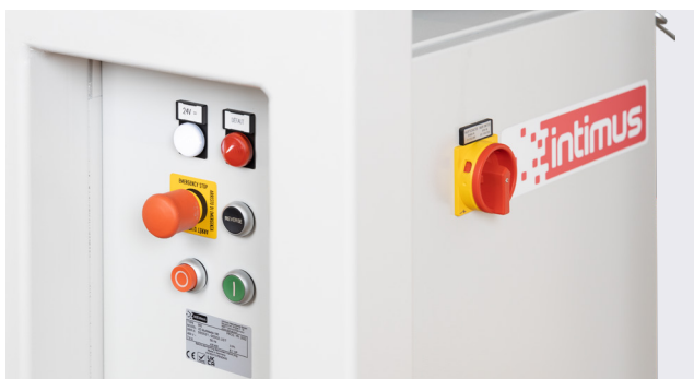
Operation via easy-to-understand push buttons