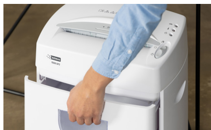
Removable 22-litre collection bin for easy disposal.