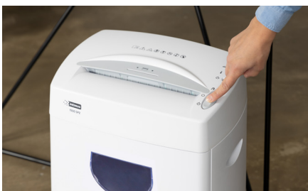
Automatic start/stop function and anti-paper jam technology.