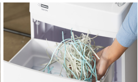
4 mm particles with security level P24 according to DIN 66399 (ISO/IEC 21964).