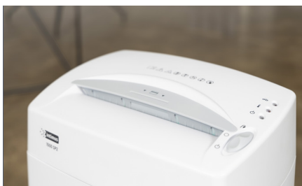
Intuitive operation thanks to clear push buttons and LED display.