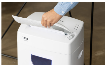
Shreds documents with paper clips and staples.