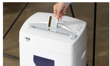
Credit cards can also be shredded via a separate feed slot.