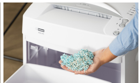
2x10 mm particles with security level P-5 according to DIN 66399 (ISO/IEC 21964).