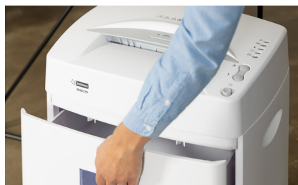
Removable 42-litre collection bin for easy disposal.